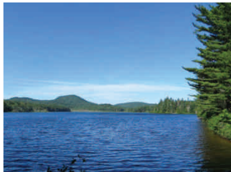
Shingle Shanty Pond

tion. The Brandreth Park Association holds recreational rights to the adjacent properties of Brandreth Associates, which owns approximately 2250 acres, and Friends of Thayer Lake, LLC, which owns 15,500 acres. The Friends of Thayer Lake, LLC property is covered by a "Forever Wild" Conservation Easement held by Sweet Water Trust.