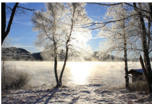
Frosty Winter Morning

ACREAGE: The Brandreth Park Association owns approximately 9950 acres, most of which is centered around Brandreth Lake, but includes a parcel at the former Brandreth Sta-