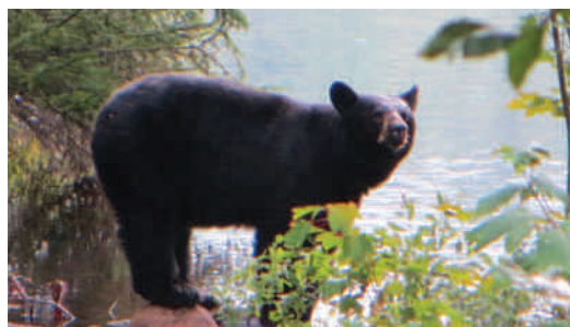
Black Bear at the Outlet

STRUCTURE: A tenancy-in-common composed of 120 interests, governed by the Brandreth Park Association. Members of the Brandreth Park Association include both Owners and Associate Members, who enjoy many of the same privileges of Owners, with the notable exception of the right to build a camp. Members of BPA must be descendants of Benjamin Brandreth.