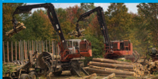
Summer Harvest in the Adirondacks

Both the APA regulations and 480-a tax reform are still being reviewed by the respective agencies, and will undoubtedly change before final submission to the Park Agency Board, the Governor and the legislature. For a more complete description of these program changes please visit the ALA website.